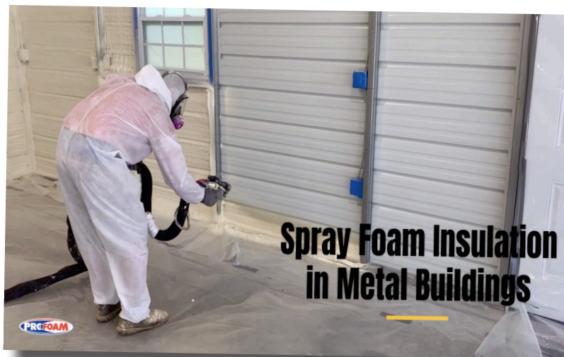
Example of a Facebook Video Ad